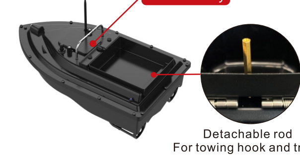
Detachable rod For towing hook and trawl